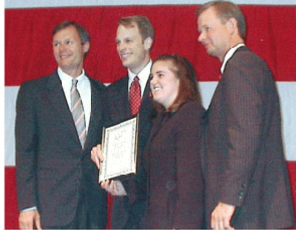
La Crosse Co. accepts Wisconsin Award

It should be a great time. Surely we will be the envy of all the districts for planning such a wonderful event. We are grateful to the Crawford County Republican Party for hosting the event for us! We hope you will consider joining us but please send your registration in early. You will find the registration form on Page 3 of this newsletter.